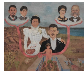
My Grandparents; My Parents and Me by Frida Kahlo